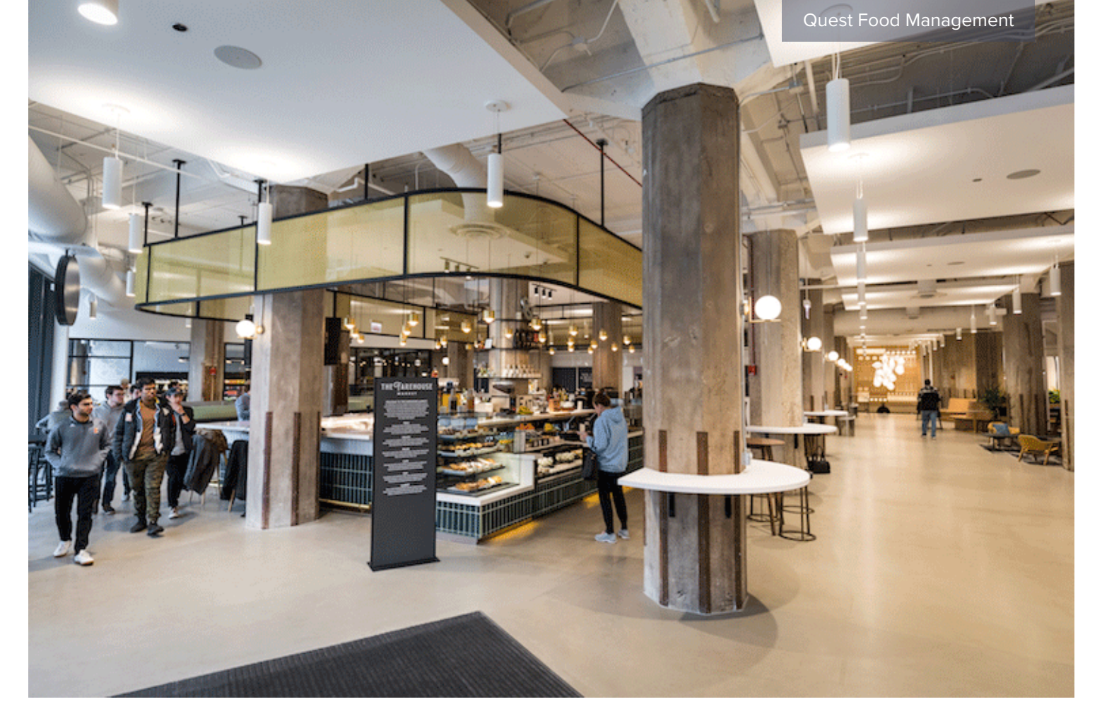
The Farehouse Market array is easily accessible, situated directly near the building entrance.

And that's what Farehouse Market looks to deliver with a multiplatform mix that includes a dual-sided coffee/cocktail bar; a retail market that sells gourmet packaged goods including beer and wine, fresh foods ranging from charcuterie to a salad bar, and packaged grab-and-go selections; and three restaurants that offer customized, to-order selections ranging from personal pizzas and plant-based bowls to burgers and sandwiches. A photo tour of Farehouse Market is available elsewhere on this site.